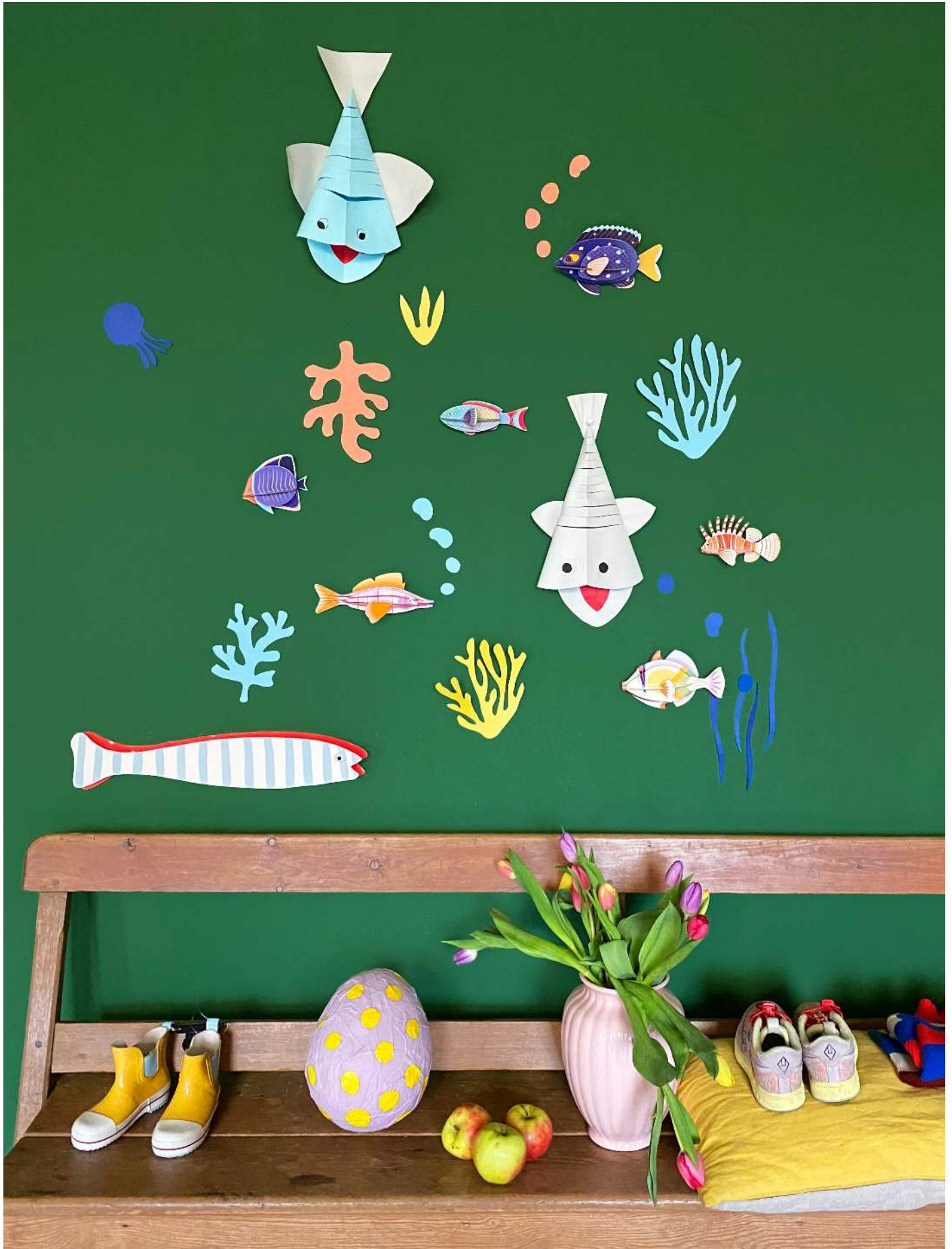
Enjoy the fun of making your own pair of fish for April Fools' Day in only 10 simple steps!